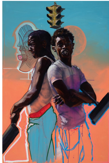
Crossing Gods 72"x48" Mixed Media, 2020