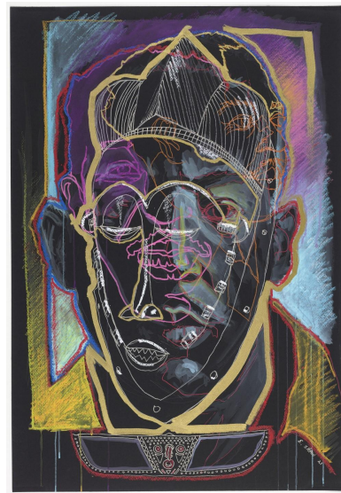
Mother to Son, 30" x 20" Mixed Media, 2022