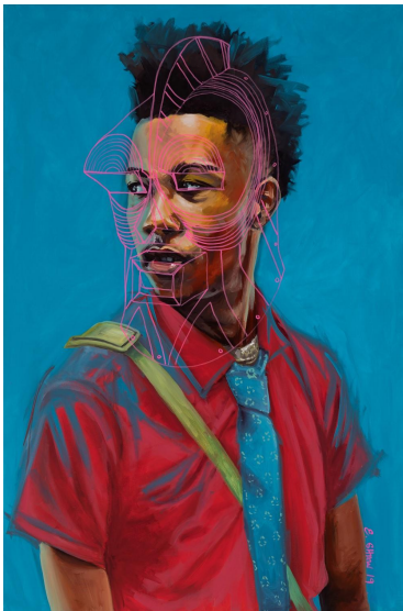
Kifwebe 60"x40" Acrylic, 2019